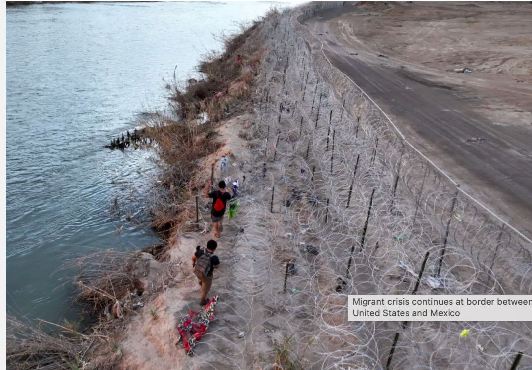
Asylum-seekers walk along a U.S.-Mexico border fence in El Paso, Texas, Feb. 5, 2024.